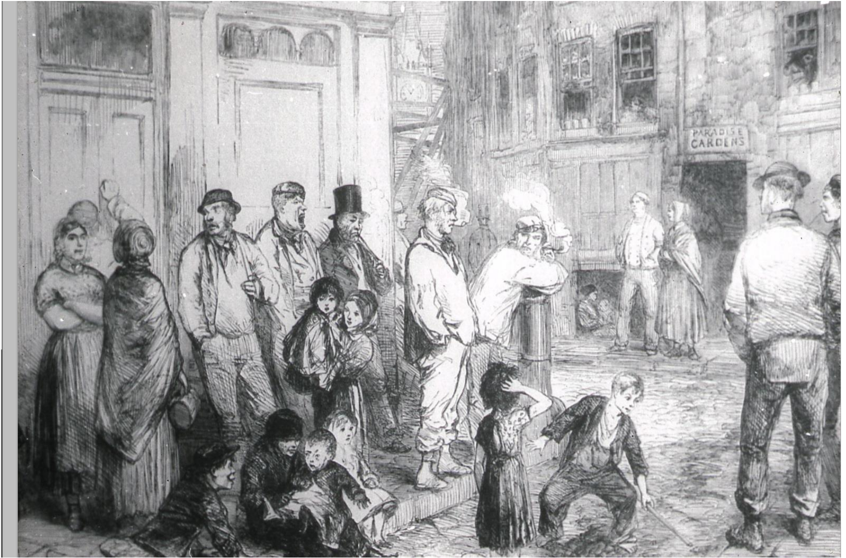
'London street corner on Sunday morning'