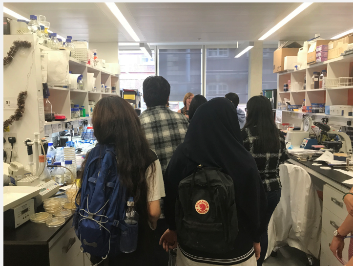
Student participants in the Inspire Summer School visited the William Dunn School of Pathology.

During this four-day summer school, students participated in academic taster sessions with top academics and graduate students, tours of academic buildings, applications and interview workshops, cultural enrichment trips and evening leisure activities. At the end of the week, each student presented a piece of original research to the group.