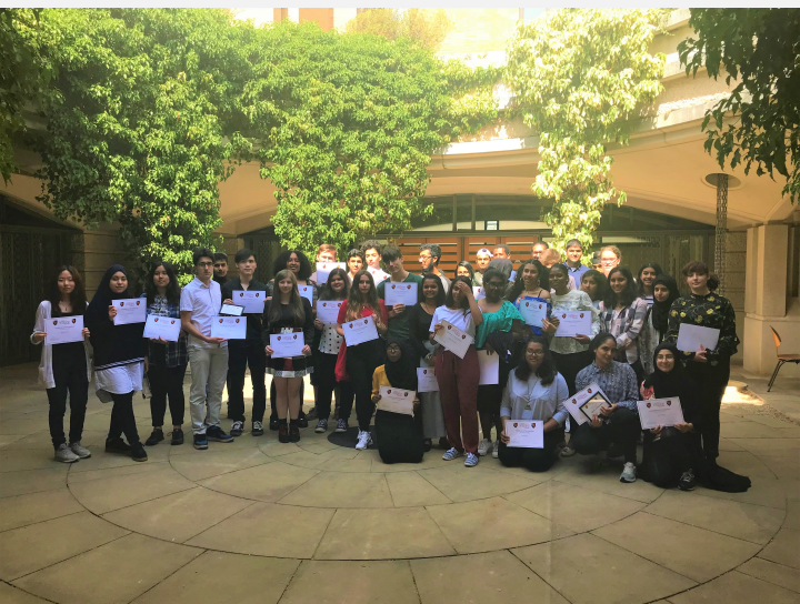
Every student who submitted a poster received a certificate of participation in the graduation ceremony.

This summer school is designed to give students a taste of university life in Oxford, and to provide them with information and guidance about choosing subjects and applying to university. This can be a very daunting prospect for most students, but one participant said of the summer school, 'the applying to university talk helped me see that Oxford could be attainable.'