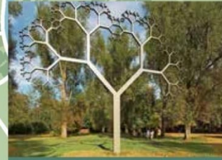
Tree-like sculpture 'Y' by Turner Prize-winning artist Mark Wallinger, in the grounds of Magdalen College